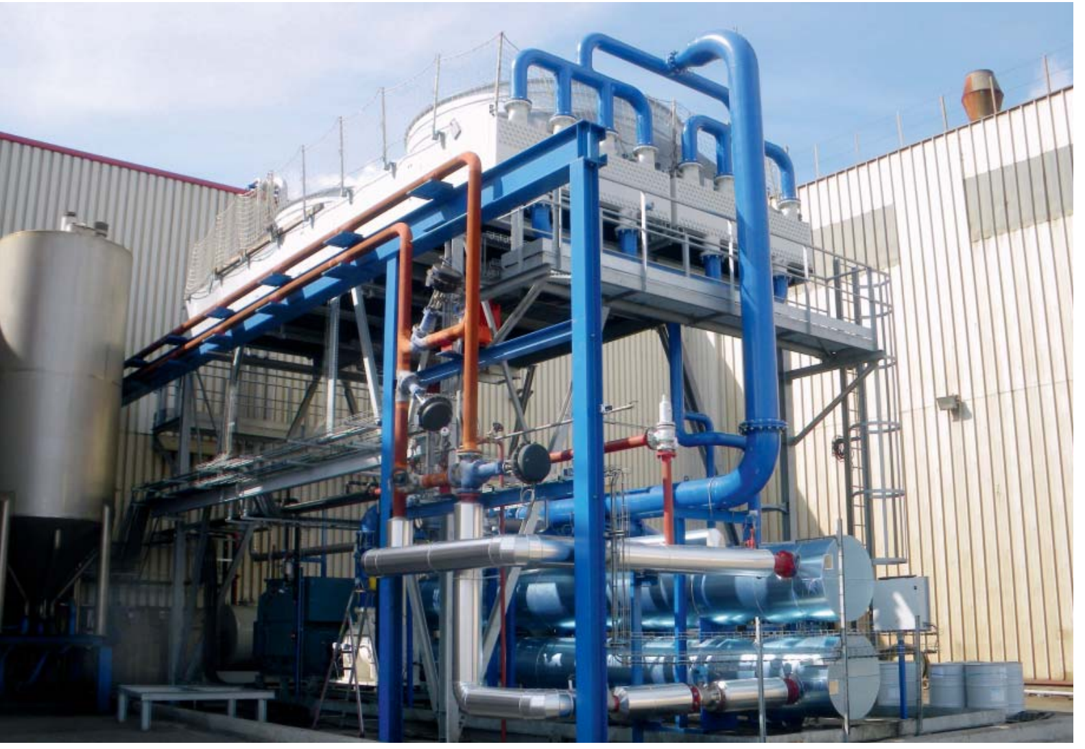
Orchid waste-heat-to-power solution at the FMGC foundry in Soudan, France

Author: Pierre du Baret, Enertime, Puteaux